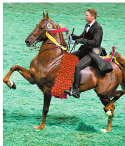
#14 Top Of The Mark $25 QTY _____