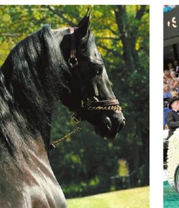
#9 Mountainview's Heir To Fortune $25 QTY _____