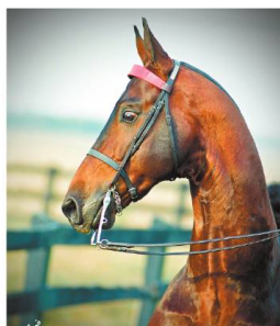
#4 Designed $25 QTY _____