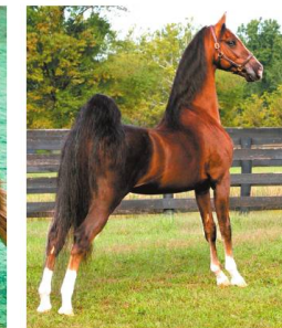
#15 Undulata's Nutcracker $25 QTY _____