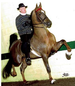
#2 Callaway's Northern Kiss $25 QTY _____