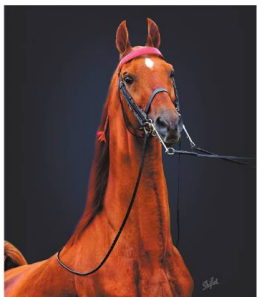
#12 Tango's Parting Kiss $25 QTY _____