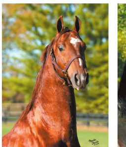
#8 Master Class $25 QTY _____