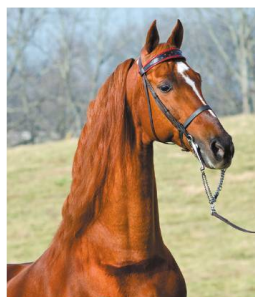
#5 I'm First $25 QTY _____