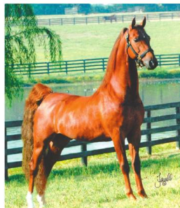
#11 Samur $25 QTY _____