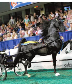
#10 Nutcracker's Nirvana $25 QTY _____